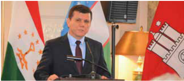
▲ H.E. Sohibnazar Gayratsho, Ambassador of the Republic of Tajikistan, reports on the 2019 Action Plan to improve the investment climate.