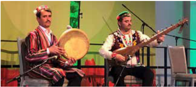
▲ The Tajik music group Tamanno also thrilled at the Berlin Nowruz Festival.