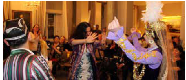
▲ Nowruz joy pure - the group from Uzbekistan invited to dance